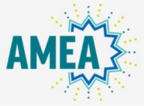
AMEA (Asian & Middle Eastern American)