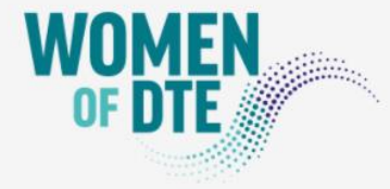
Women of DTE