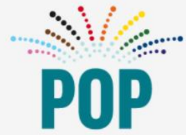
POP (Power of Pride)